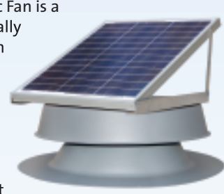
ROOF MOUNT 10, 20, 30 OR 50 WATT

Natural Light's Solar Attic Fan is a simple and environmentally sensible solution that can protect your home and save you money. Powered completely by free solar energy, this sleek and efficient vent is both compact and quiet. And let's not forget powerful! The new 50 watt model vents up to 3,100